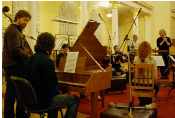
Left: St. PCP Recording Session