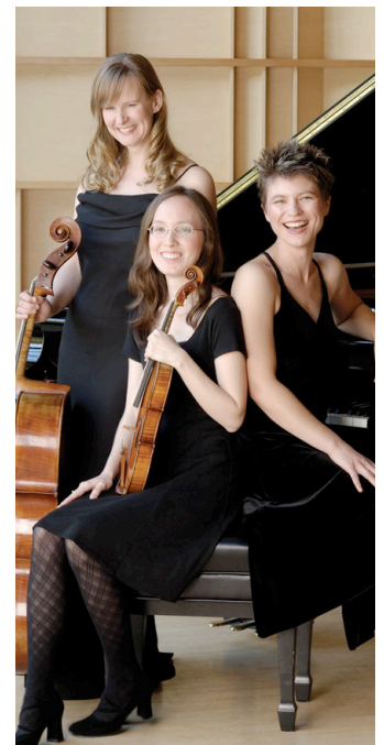
Right: Icicle Creek Piano Trio