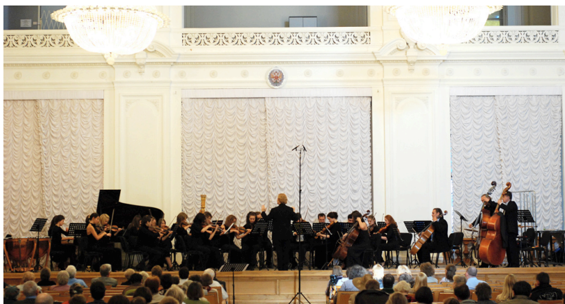
St. PCP in performance in May 2008, White Hall, Technological University

cultural capital of Russia, and you can help make its activities possible! Please contact us if you would like to join those who help the St. Petersburg Chamber Philharmonic. The St PCP would like to give a special thank you to our present donors and sponsors, all of whom can be found listed on our website!