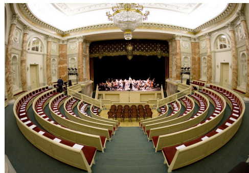
The St. PCP in the Hermitage Theatre

The St. PCP added another festival to its list in May 2009 when it performed in the opening concert of the 14th International Musical Olympus Festival. The Musical Olympus Festival's mission is well in step with the St. PCP's with its focus on introducing up-and-coming talent to St. Petersburg. During the festival, about 25 young musicians from more than 12 countries were presented in concert. Other orchestras represented in this prestigious festival were the St. Petersburg Philharmonic, the Capella Orchestra and the Marinsky (Kirov) Orchestra. It was an honor and a clear indication of how far this young orchestra has come since its founding in 2002 for the St. PCP to be performing along these venerable orchestras of the city.