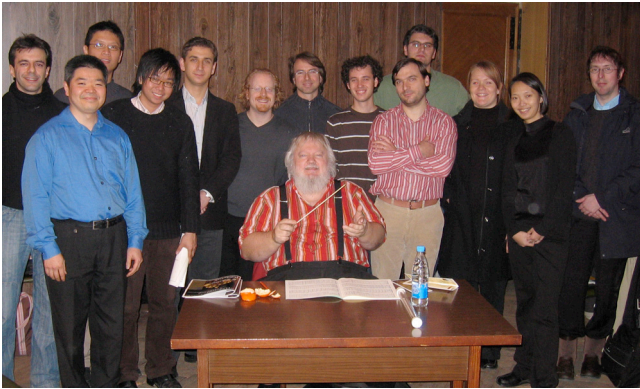
Leif Segerstam (center) and the 2008 International Conducting Masterclass Participants