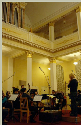
Recording in the Melodia Studios