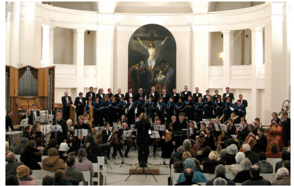
St. PCP performs “Judah” in 2008

One particularly exciting aspect of this Russian-American concert was that several students and faculty from Ithaca College School